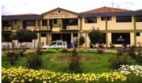
San Juan de Dios hospital, Cuzco, Perú

Throughout 2018, we have aided in particular the project in Burkina Faso , fourth poorest country in the world. Our aid resulted in the construction of the operating room, optics workshops, scholarships for two local ophthalmologists and one local optic; the future leaders of the project which is going to be fully operative by the end of 2019. Moreover, we have acquired new equipment and sent funds for the purchase of a plot of land.