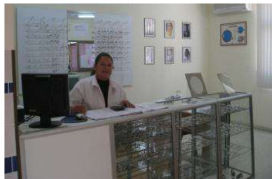
Ophthalmology centre in Santa Cruz, Bolivia

Vision mundi collaborates in constructing, equipping, training the personnel, and managing of ophthalmology centres with the condition that they will be managed 100% by local personnel and that they help the people most in need. We have built and are currently collaborating with 4 ophthalmology centres in