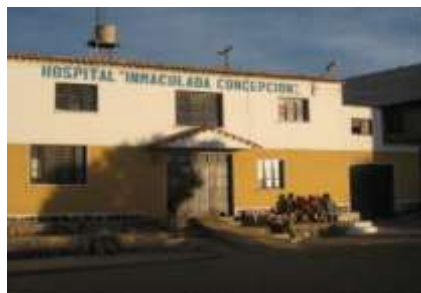
Hospital de La Concepción