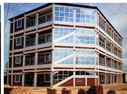
Eureka Medical Centre, Burkina Faso